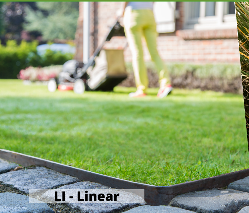
LI - Linear