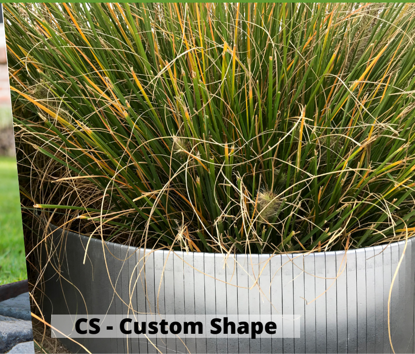
CS - Custom Shape