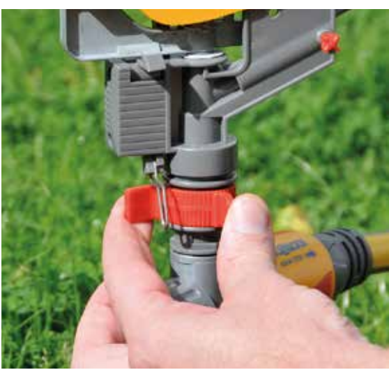
3. Arc Adjusters & Trip Lever

The two red arc adjustment rings and the small metal trip lever work together to set the motion of the spray head.