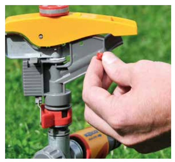
2. Deflector Dial